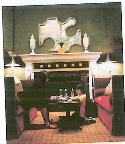
An intimate sitting area at the Monaco is home away from home for two guests.

Hollywood stars on location gravitate to the Ritz-Carlton Georgetown ( www.ritzcarlton.com ; from $399) or the luxe Mandarin Oriental ( www.mandarinoriental.com/washington ; from $245), in the city's Southwest quadrant. The R-C's Georgetown location has an unlikely pedigree: From 1932 to 1971, locals brought garbage there for incineration. Reminders of the building's fiery former life include bowls of Atomic Fireball candies and a private dining room inside the smokestack. The massive Mandarin Oriental is a Vegas-scale take on luxury lodgings and houses the elegant CityZen restaurant. The reason stars love it, however, may be the reason you won't. Although close to the Mall, the hotel sits isolated on what feels like a peninsula, far from D.C.'s other attractions.