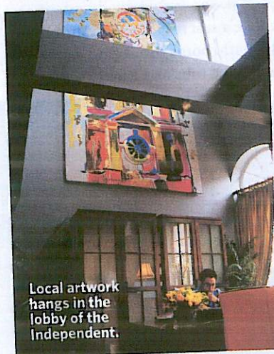
Local artwork hangs in the lobby of the Independent.